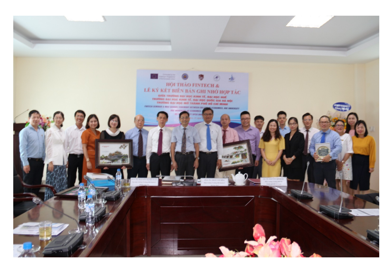
Some photos at the ceremony